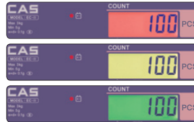
▲ Three backlight colors

Set the weight or count range and the EC-2 will indicate whether the actual weight or count is HI, LO, or OK, with alarm beep sounds and color display indicators. The optional Light Tower offers a larger visual alternative.