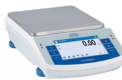
PS 10 X2 Precision balances