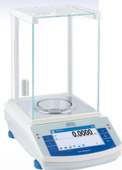
AS X2 Analytical balances

USB interface facilitates quick transfer and copying of any results of your work (measurements, reports, databases) to other balance.