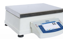
APP X2 Precision balances